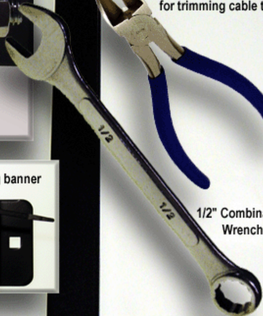
1/2" Combination Wrench