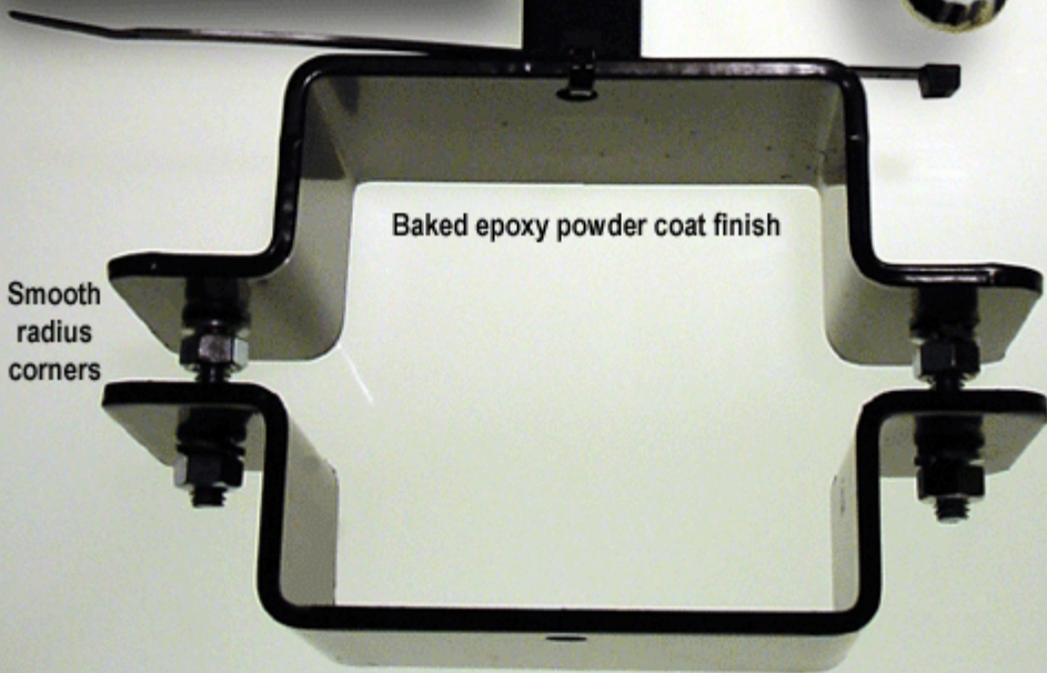
Baked epoxy powder coat finish